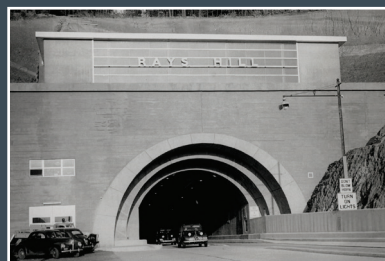
Rays Hill Tunnel