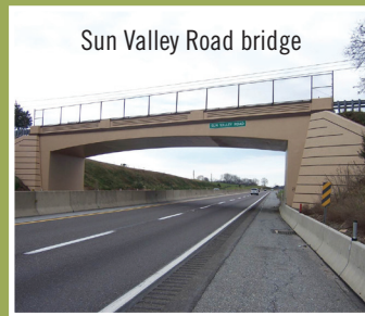
Reinforced Concrete Rigid Frame – 38