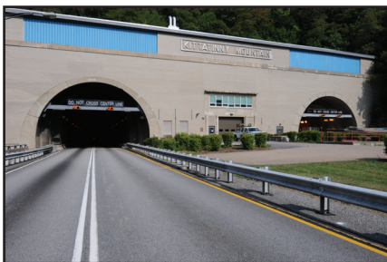
Kittatinny Mountain Tunnel