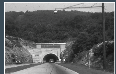
Sideling Hill Tunnel