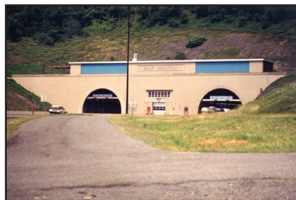
Blue Mountain Tunnel