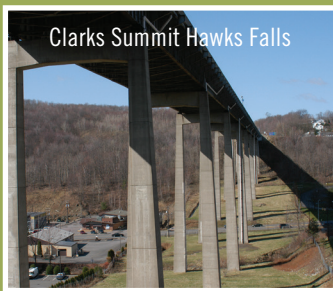
Major Truss – 3