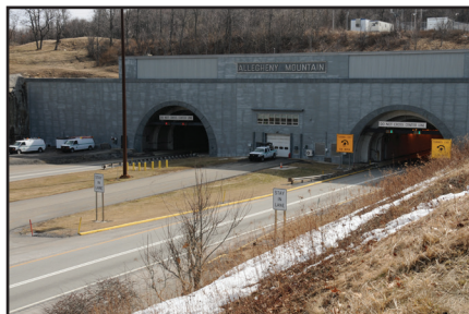
Allegheny Mountain Tunnel

Tunnels designated as Tube 1 are the original tunnels which allowed a single travel lane in each direction to flow through the tunnel. When traffic demands increased, tunnels designated as Tube 2 were constructed to allow for two travel lanes in each direction and allow for a single traffic direction in each tube.