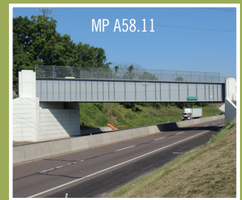
Thru-Plate Girder – 49